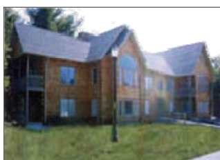
Laney Lodge, Fairfield, PA September 11-13, 2009 www.middlecreekbible.org