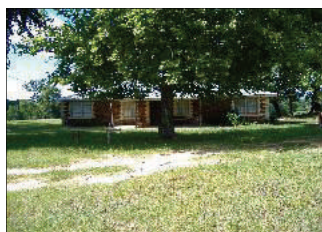
Light of Christ Ministries, Gause, TX October 2-3, 2009 www.lightofchristministries.com