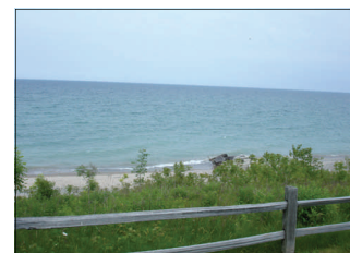
Siena Center, Racine, WI May 21-23, 2010 www.racinedominicans.org

For God, who said, "Let light shine out of darkness," made his light shine in our hearts to give us the light of the knowledge of the glory of God in the face of Christ.