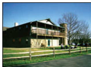
Camp Hoblitzelle, Midlothian, TX March 5-7, 2010 www.hoblitzelle.com