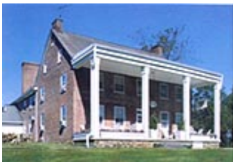
“The Manor” at Middlecreek Bible Conference Center located in Fairfield, PA.

Please keep retreat participants in your prayers. (For a schedule of events, visit our website www.dragonflyministries.com and go to the Retreat page.